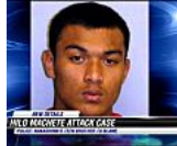
Police identify 16-year-old suspect in Big Island machete attack