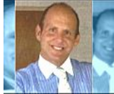
Clues found in search for missing Big Island business owner