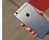
Forget the iPhone 6. Next hit Apple product revealed! The Motley Fool