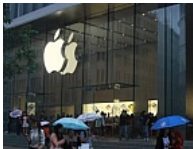
One small company makes the gadget possible, and...