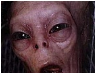
Shocking! Important Information That Could Be...