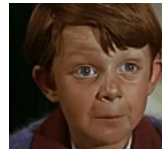
30 Child Actors Who Tragically Died Young