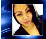
Family of apparent drug overdose victim speaks out