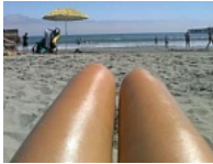
Women have been urged to cease posting these...