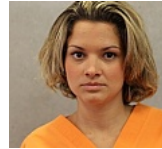
Honolulu arrest records. do you know?