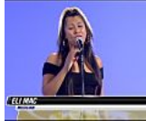
Former American Idol Contestant Performs on Sunrise