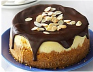
Save $5.00 on any online cooking class from the...