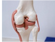
Unbelievable clinical results show people getting...