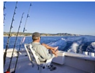
Calculate Your Net Worth. How Do You Stack Up...